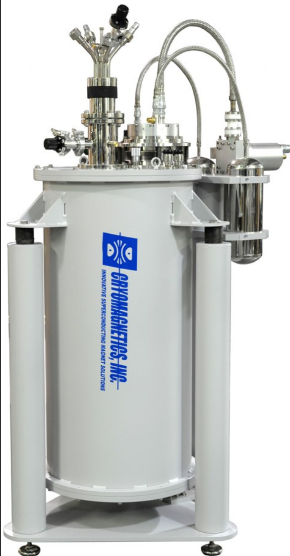
C-Mag Vari-9 System

Cryomagnetics' C-Mag systems are versatile property measurement systems that provide the researcher with exceptional range, versatility, accuracy, and automation in materials characterization. Based on the latest cryocooler refrigeration technology, the systems are very easy to set up, operate and maintain.