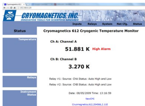
Model 612 Web interface

Monitors connect directly to any 100/10 Ethernet Local-Area-Network (LAN). The TCP and UDP data port servers bring fast Ethernet connectivity to data acquisition software including LabView™. Using the SMTP protocol, the monitor will send e-mail based on selected alarm conditions. Using the Ethernet HTTP protocol, the monitor's embedded web server allows the instrument to be viewed and configured from any web browser.